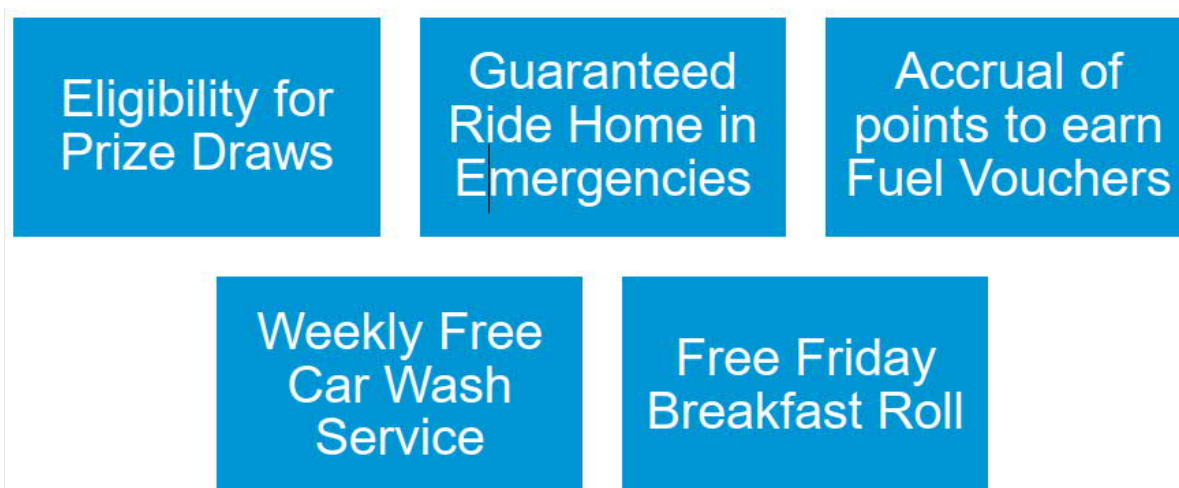
Plate 6.1 - Construction Worker Incentives for Car Sharing Examples